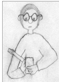
Drawing by Toby Wacker