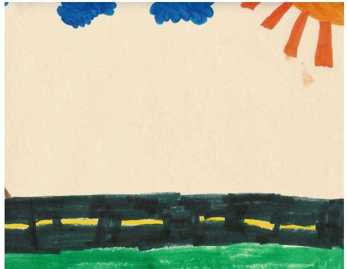
Drawing by Valerie