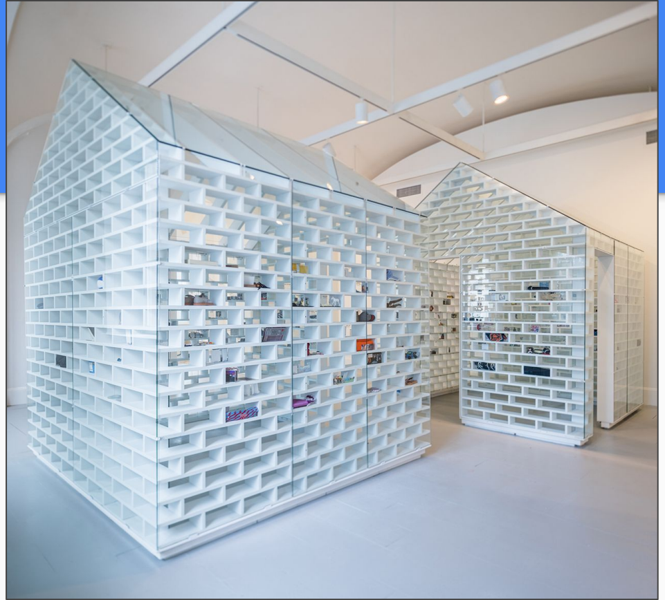
Gun Violence Memorial Project. 700 “bricks” represent Americans killed by guns every week.

What would a world without gun violence look like?